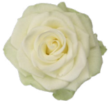
Soft White Romance