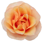
Honey Orange Romance