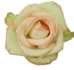
Twisty White Romance