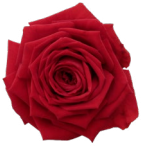
Cherry Red Romance